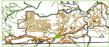
TOWN OF TRUCKEE, CALIFORNIA