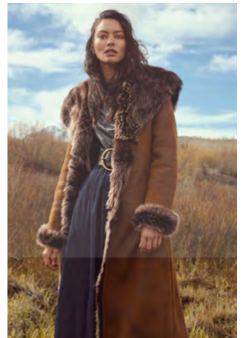
Dakota Hooded Toscana Sheepskin Coat $2495

Skillfully crafted of fine Toscana sheepskin for ultimate insulation and dramatic impact, the Dakota coat's impressive shape and style make it a standout she will wear for many years to come.