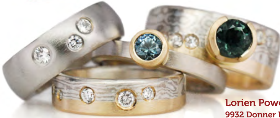
Handcrafted Contemporary Rings $1500 - $4500

Distinctive turquoise and sterling silver earrings by award-winning, Oaxacan-born artist Federico Jimenez, based out of California.