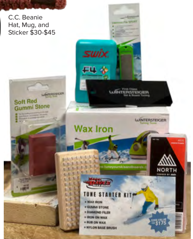
Ski Tune Starter Kit $175

Everything you need to wax your own skis: wax iron, scraper, gummi stone, diamond stone, brush, edge file guide, all wrapped up with a red bow!