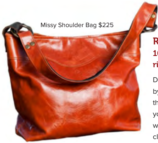
Missy Shoulder Bag $225

Riverside Studios 10076 Donner Pass Rd. riversidestudiostruckee.com