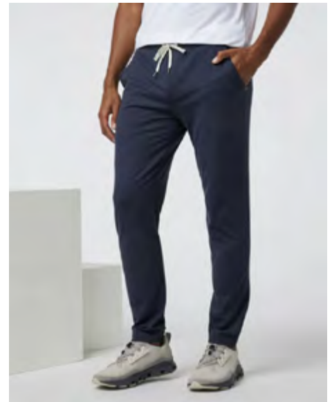
Vuori Ponto Performance Joggers $98

The softest performance sweatpants in the signature DreamKnit™ fabric, featuring a straight-leg modern fit and endless comfort – light, stretchy and buttery soft, you'll live in these.