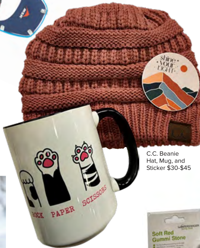
C.C. Beanie Hat, Mug, and Sticker $30-$45

Put together a package she'll love with reasonably-priced, warm, and fashionable C.C. Beanies in a variety of colors with a fun mug and sticker.