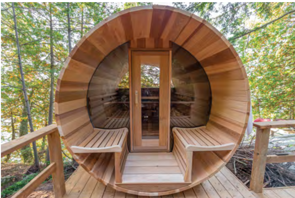
Timber Tranquility Barrel Sauna. Starting at 13,700

Elevate the art of sauna bathing in the 7x7 Western Red Cedar Barrel with Front Porch, electric heater, interior benches, and side windows.