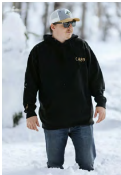
Unisex Hooded Sweatshirt with CA89 Tree on Sleeve $60

This black hoodie features the iconic CA89 logo and a tree graphic on the sleeve, embodying the spirit of Tahoe's outdoor lifestyle. A perfect blend of warmth and durability for all seasons.