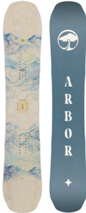
Arbor Swoon Rocker Sale $549.95

For her - a mountain twin for the experienced rider seeking pinnacle, all-mountain performance.