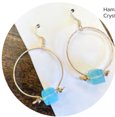
Hammered Crystal Earrings $78

Mountain Arts Collective 10065 Donner Pass Rd. mountainartscollective.com