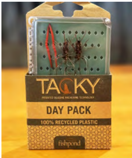
Truckee River Fly Assortment $59.99 - $89.99

This kit comes with a Fishpond Tacky fly-box and a selection of one dozen or two dozen assorted flies. A great gift for any fly fisher.