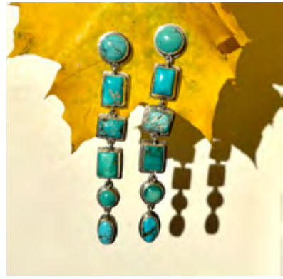
Cascading Turquoise Earrings $600

Designed and handmade in Truckee by Kahlil Johnson in a variety of colors, this leather shoulder bag is ready for all your daily or travel needs. Stylish and with two zipped inner pockets and snap closure.