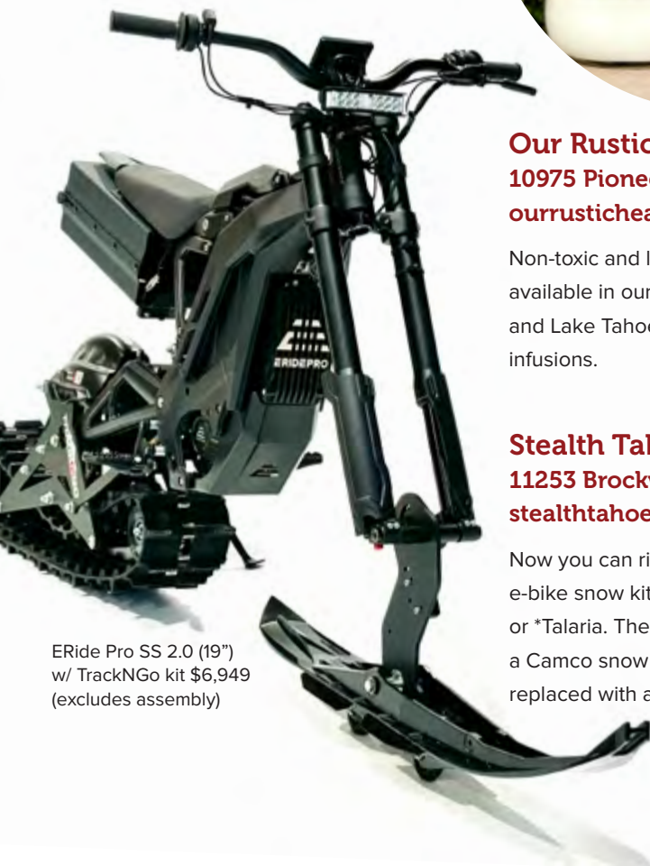
ERide Pro SS 2.0 (19") w/ TrackNGo kit $6,949 (excludes assembly)

Now you can ride year-round! Aftermarket e-bike snow kit for your *ERide Pro, *Surren, or *Talaria. The rear wheel is replaced with a Camco snow track and the front wheel is replaced with a Pathfinder ski.