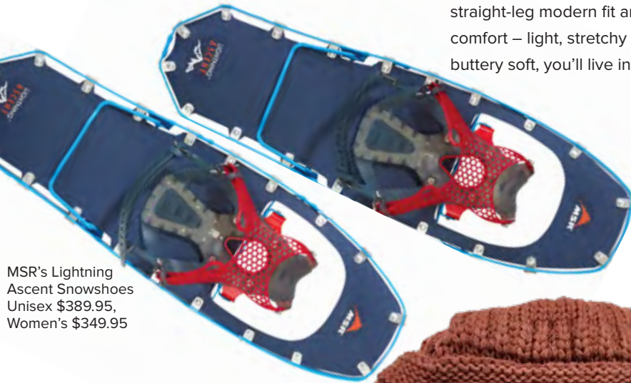
MSR's Lightning Ascent Snowshoes Unisex $389.95, Women's $349.95

MSR's Lightning Ascent snowshoes are the top choice for ultralight and high-performance snowshoeing on all types of terrain.