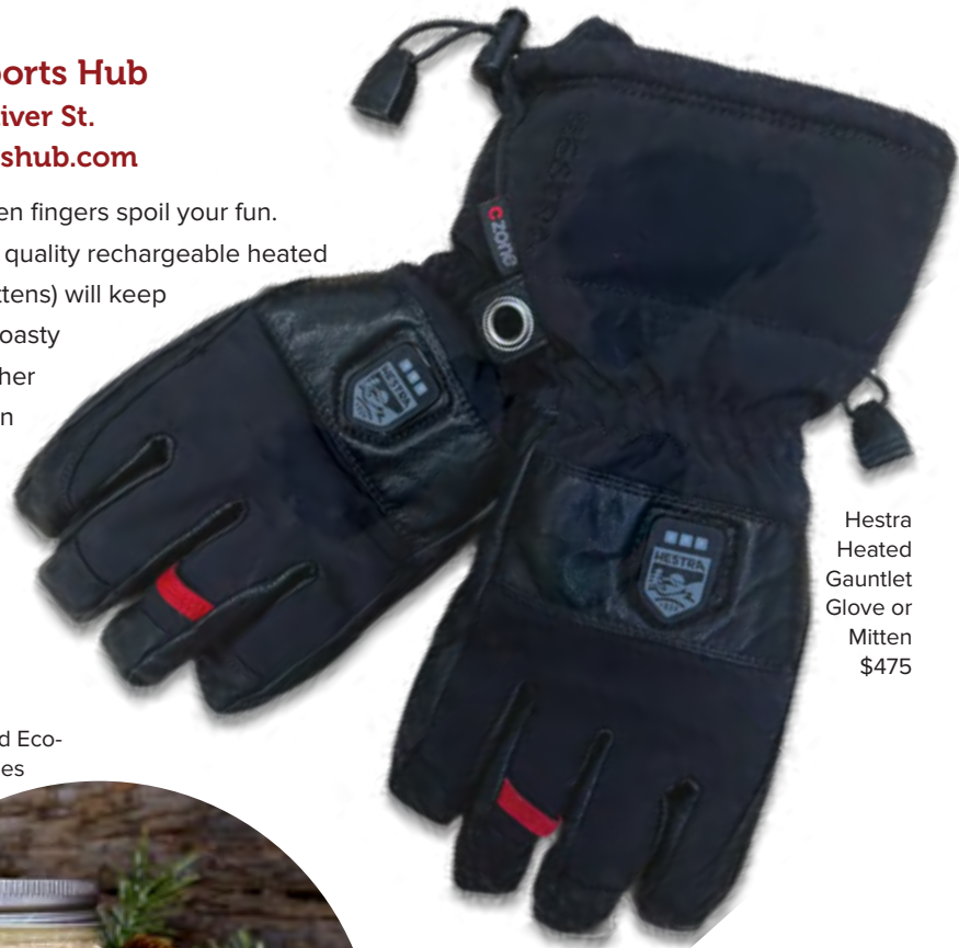
Hestra Heated Gauntlet Glove or Mitten $475

Don't let frozen fingers spoil your fun. Hestra's high quality rechargeable heated gloves (or mittens) will keep your fingers toasty and dry whether you are out on the mountain or snow blowing the driveway.