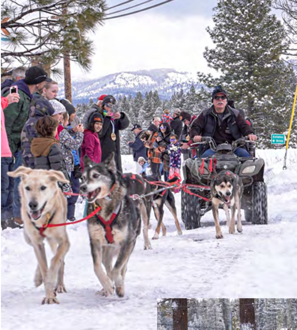
Sled dog race demonstrations and a hockey match at Truckee River Regional Park during the 2023 Truckee Winter Carnival.

of the ice gallery sparkled with all the color of a beautiful rainbow creating an appearance of ‘unusual splendor!’ The new ice palace had several rooms with open fireplaces for much appreciated warmth.