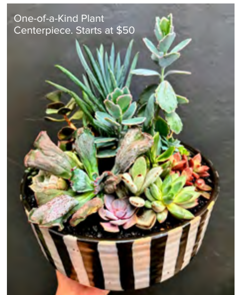
One-of-a-Kind Plant Centerpiece. Starts at $50

An original painting with the universal symbol of love and a personalized message makes a great gift that lasts a lifetime.