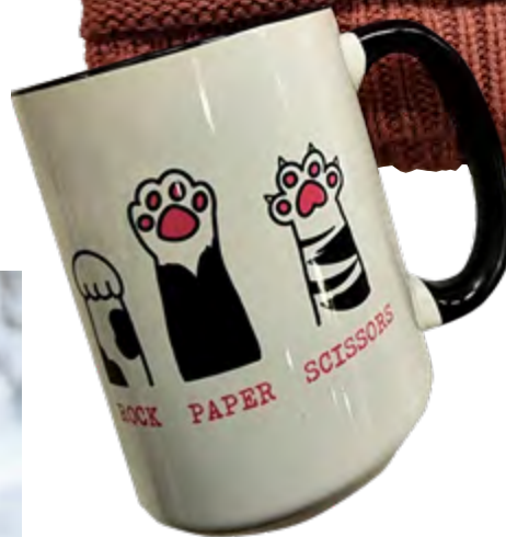
C.C. Beanie Hat, Mug, and Sticker $30-$45

Put together a package she'll love with reasonably-priced, warm, and fashionable C.C. Beanies in a variety of colors with a fun mug and sticker.