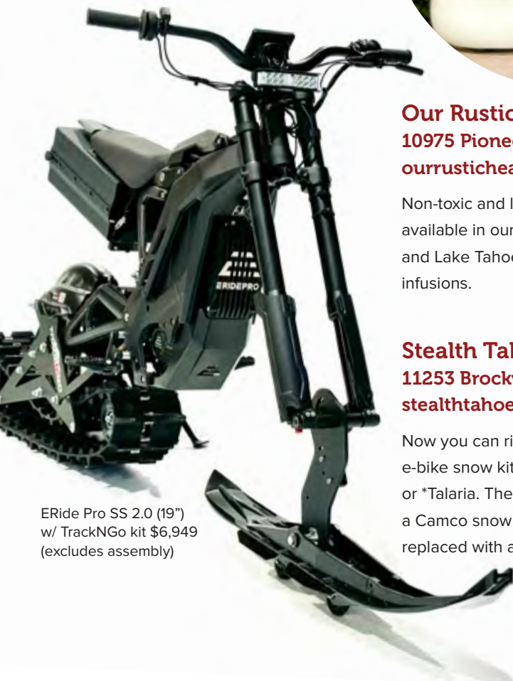
ERide Pro SS 2.0 (19") w/ TrackNGo kit $6,949 (excludes assembly)

Now you can ride year-round! Aftermarket e-bike snow kit for your *ERide Pro, *Surron, or *Talaria. The rear wheel is replaced with a Camco snow track and the front wheel is replaced with a Pathfinder ski.