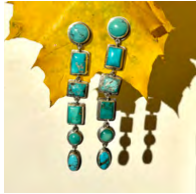
Cascading Turquoise Earrings $600

Designed and handmade in Truckee by Kahlil Johnson in a variety of colors, this leather shoulder bag is ready for all your daily or travel needs. Stylish and with two zipped inner pockets and snap closure.